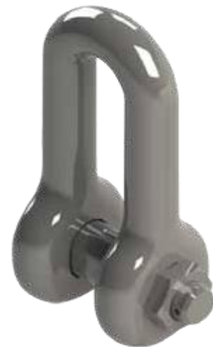
Example of CJ 'LTM' Shackle